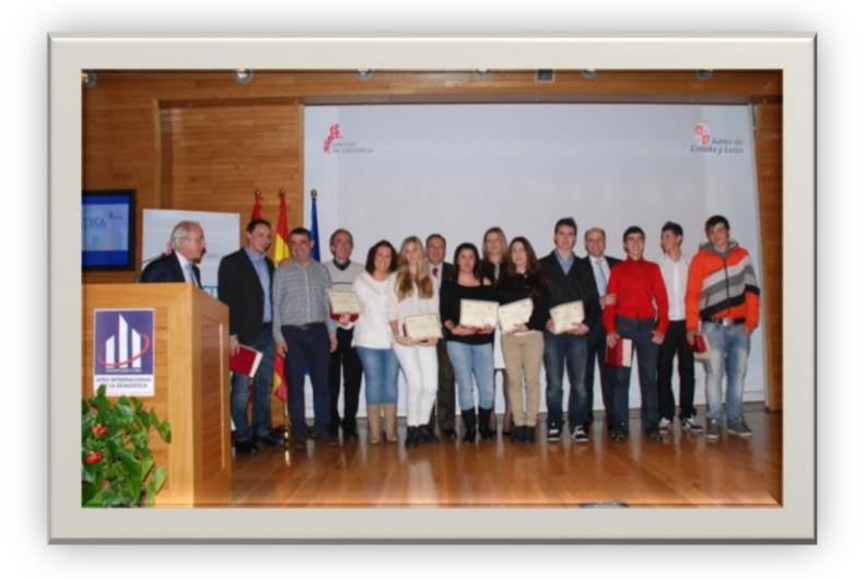
Winners of the Statistical Office of Castilla y León's XII School Competition on Statistical Works receive their rewards at a special ceremony.

February the XII School Competition on Statistical Works. The competition was open to students in secondary and high education from Castilla y León. On November 22, the competition awards ceremony was held and attended by statistical and educational authorities and the winners along with their family members and friends. The first-place award in the secondary-education category was awarded to the work titled "Where Bierzo is called Cabrera (Donde el Bierzo se llama Cabrera)", which was presented by IES from Puente de Domingo Florez (León). Politécnico de Soria was the winner in the high-education category for its work titled "Do we have young, healthy habits? (¿Seguimos los jóvenes hábitos saludables?)." During the awards ceremony, the significance of 2013 as the International Year of Statistics was highlighted as was the importance of statistics in our society—a fact that students had established through their works. <u>Click here to view the winning works</u>.