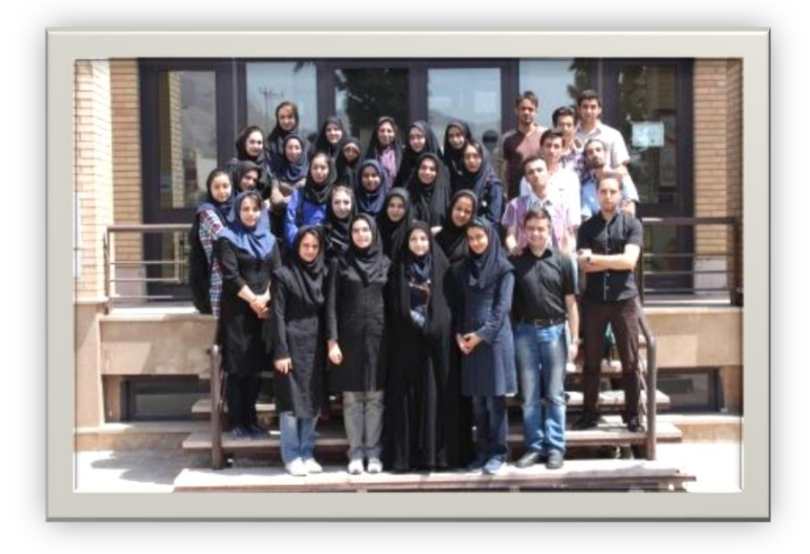
Isfahan Mathematics House Statistical Summer School attendees pose for a group photo.